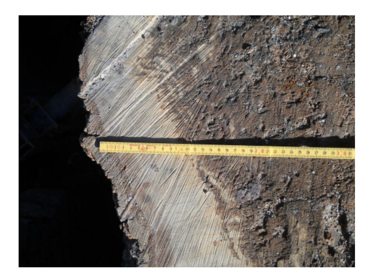
Picture 5 The thickness of sound healthy wood is in parts less than 10 cm