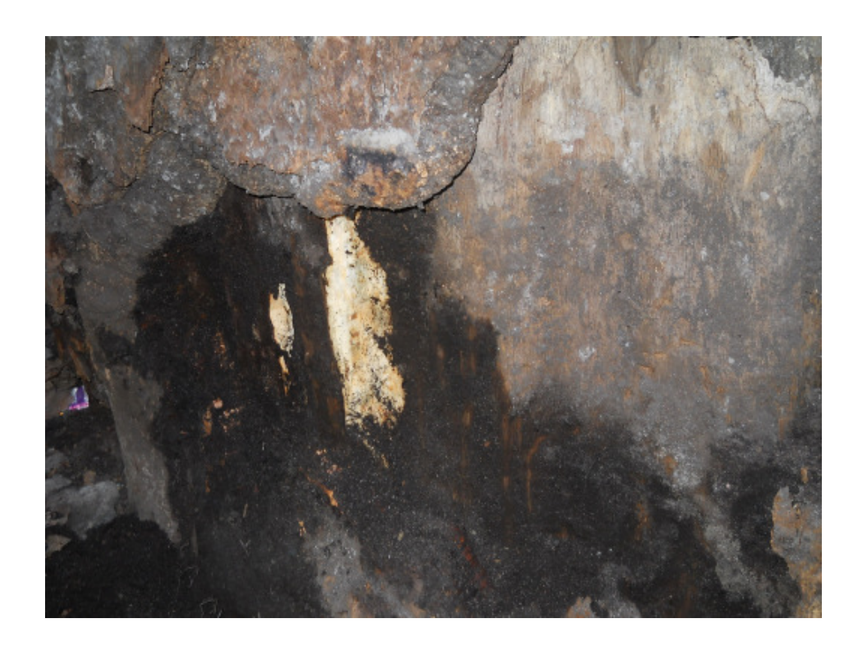
Picture 3 Big old wound with decay at the stem base 3 m deep under the road