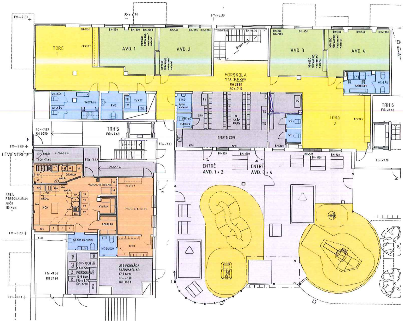
PLAN 3, ENTRÉPLAN