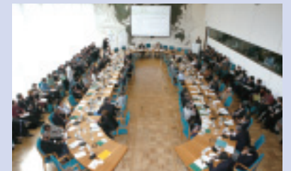
Bonn Mayors Conference on Local Action for Biodiversity

At COP 9, the Decision “Promoting engagement of cities and local authorities,” which was the first decision involving local authorities, was adopted. The role of cities and local authorities in the implementation of the UN CBD gained international recognition.