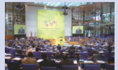
CBD COP9 (Bonn, Germany, May 2008)

Curitiba (2007) ► Bonn (2008) ► Aichi-Nagoya (2010)